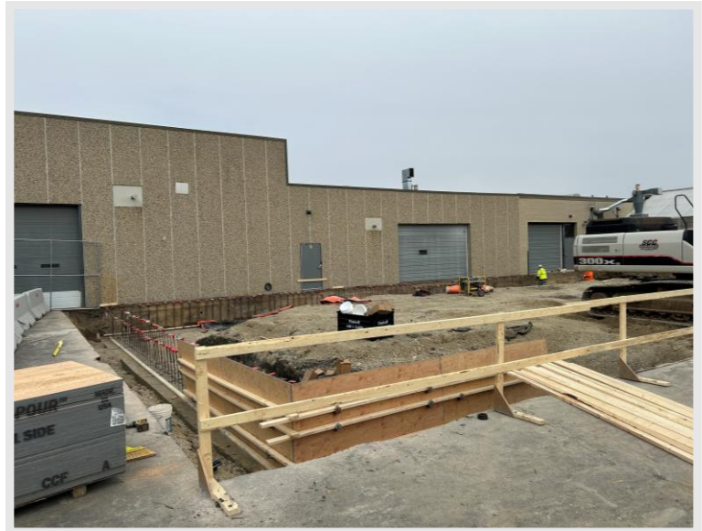
Findorff crews working to install footings and prep formwork and reinforcement for upcoming foundation wall pours.